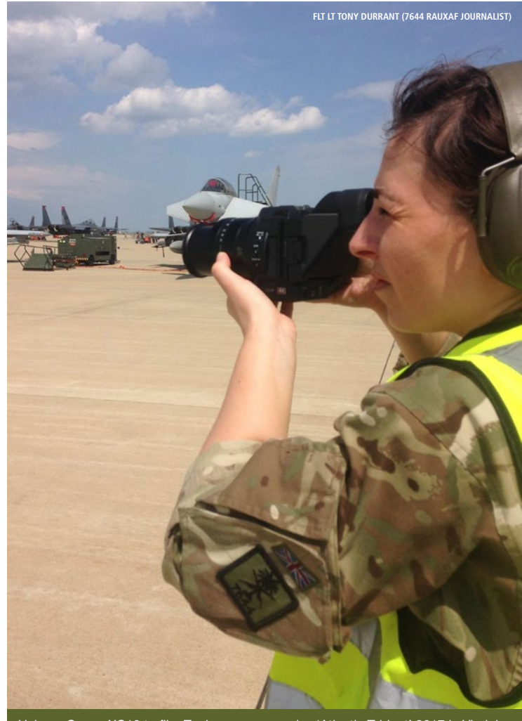
Using a Canon XC10 to film Typhoons on exercise 'Atlantic Trident' 2017 in Virginia, USA, to provide short-form video output for the RAF's social media channels

of the time focusing on PR, engineering, police and ID photography. Secondly, it's a photographer post which gives some opportunities to film but this is not the primary role. So, instead, because I wanted the financial stability, I took a job as a multimedia manager within the marketing team of a company in the manufacturing sector. I was very pleased when, in 2019, this job brought me the opportunity to codirect a social reality drama, Amputee , a short film that is currently going through the film submission circuit.