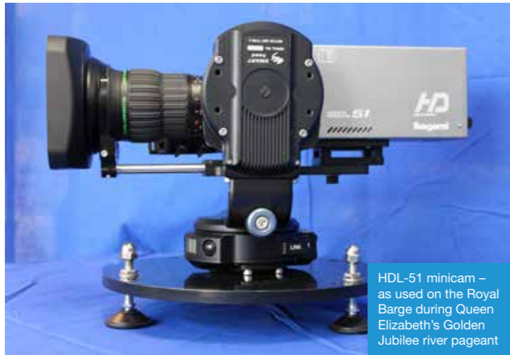
HDL-51 minicam – as used on the Royal Barge during Queen Elizabeth's Golden Jubilee river pageant

See more about Ikegami: www.ikegami.com and more about its history: www.ikegami.com/milestones.html