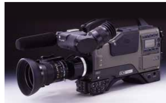
The HL-V55 camera was the first to include an integral Betacam SP recorder

As the new millennium dawned, Ikegami was developing 0.18µm rule application-specific integrated circuits (ASICs) and was the first to use these in broadcast cameras with the debut of the HDK-790E and 79E in 2001. With DVCPRO from Panasonic and DVCPAM from Sony now emerging as the two main competitors in the digital tape format market, Ikegami