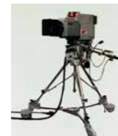
The TK-301A, which established Ikegami as a major manufacturer of colour cameras

1978 was a particularly good year for new Ikegami cameras. The Saticon-tubed HL-77 was offered as part of the ENG range (as simply a camera, with no recorder or onboard battery) while, for top-of-the-range lightweight field and studio production, the 18mm-tubed HL-79A appeared. This was a camera optimised to produce the best possible picture with minimal need for engineering intervention. Full-sized studio cameras were also being developed alongside the lightweight range, with advances in automatic adjustment, winning Ikegami an Engineering Emmy in 1981 for its digital computerised adjustment of the HK-312 and HK-357A.