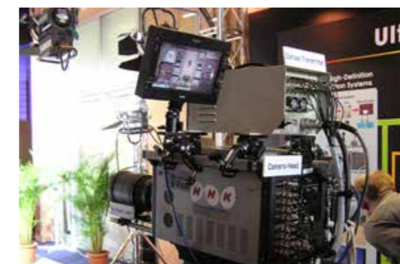
First sight at IBC2006 of the experimental Super Hi-Vision camera Ikegami had been working on with NHK

Ikegami is now on its fourth generation of 8K Super Hi-Vision cameras with the single 33-million pixel Super 35 CMOS sensor, PL-mount SHK-810, developed in cooperation with NHK.