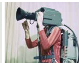
The first 'Handy Looky' camera, the HL-33 was an early ENG favourite