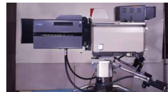
The HK-357A launched in the early 1980s won Ikegami an Engineering Emmy