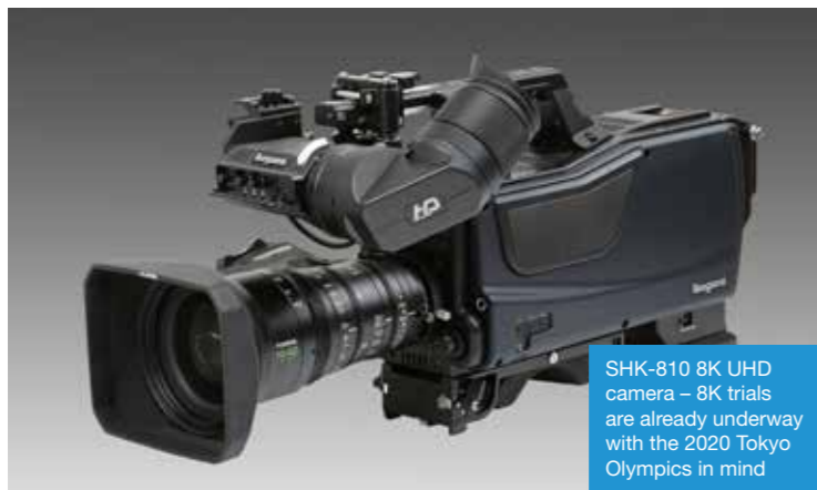
SHK-810 8K UHD camera – 8K trials are already underway with the 2020 Tokyo Olympics in mind