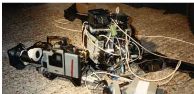
Connections to the portable Panasonic M2 recorder and sound could be complicated for the, complex handheld shots that The Bill pioneered