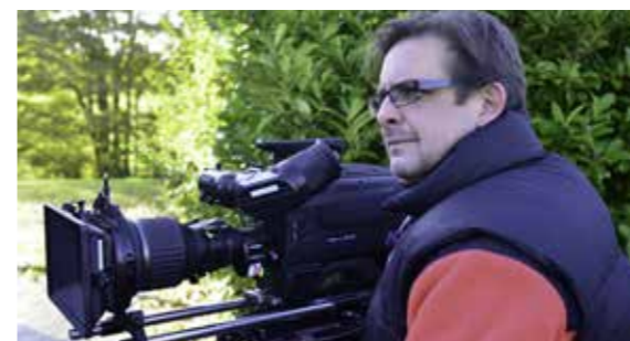
Shooting with the HDK-79EXIII on location for Yorkshire TV drama series Emmerdale

produced the versatile HL-DV7W DVCAM camcorder, which became very popular worldwide among cameramen for its excellent picture quality, ability to switch between 4:3 and 16:9, robust build quality, and features previously only found on much pricier Betacam offerings. It was around this time that Ikegami also took the decision to supply future cameras with B4 lens mounts rather than the B3 on earlier products. In 2003 the DNE-31 portable hard disk recorder suitable for broadcast appeared, as did the first microwave digital Hi-Vision wireless system combining a camera with an on-board orthogonal frequency-division multiplexing (OFDM) modulated transmission system.