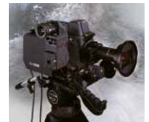
The EC-35, an early digital cinema camera – launched in 1983

The advent of suitable frame interline transfer (FIT) CCDs allowed the company to move from the era of the tube into the digital age for cameras, with the HL-55 Unicam Portable Colour Camera launched