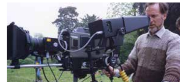
Top-end lightweight field/studio camera, the HL-79A, from the late 1970s