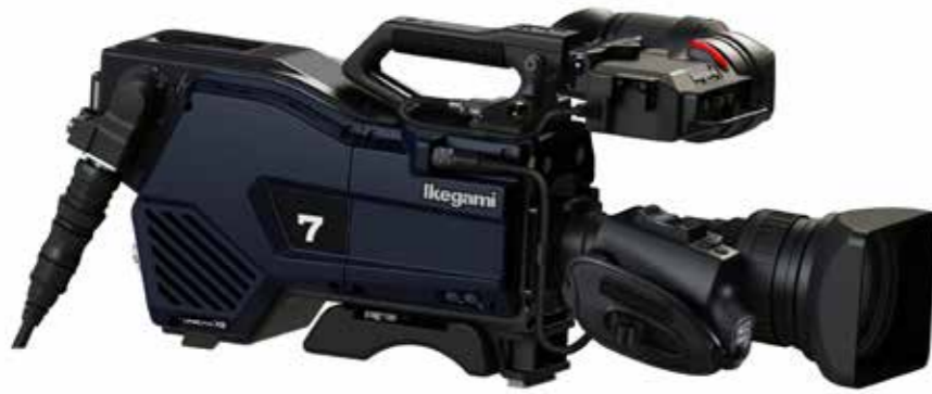
UHK-430 4K camera