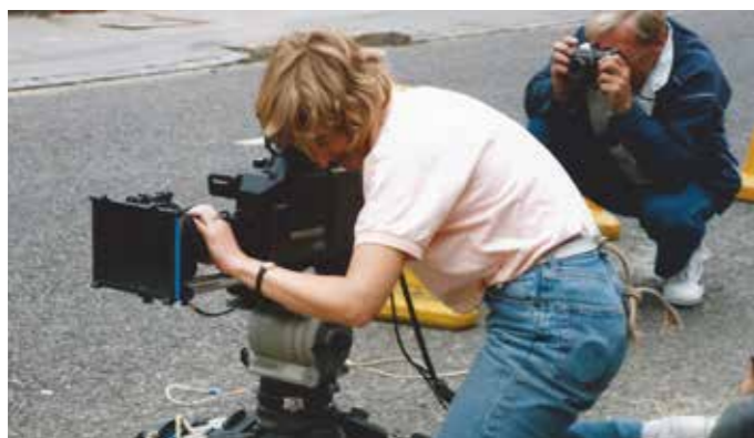
Out on the streets shooting The Bill on a HL-55; the camera was controlled from an early fly-away setup with the lighting director working either out of a van or from a customised trolley