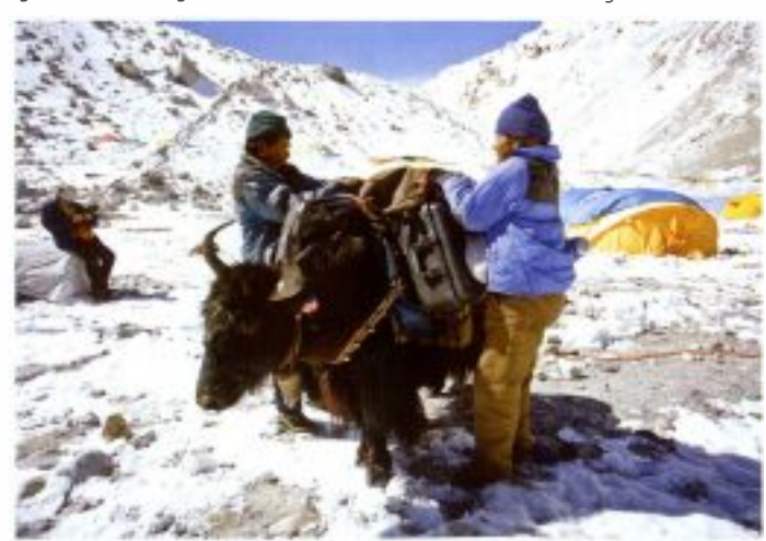
Tibetan yak herders tie the Peli cases on at Base Camp

The long ascent to BC took five days, fortunately by road; our jeep drove ahead allowing me to film