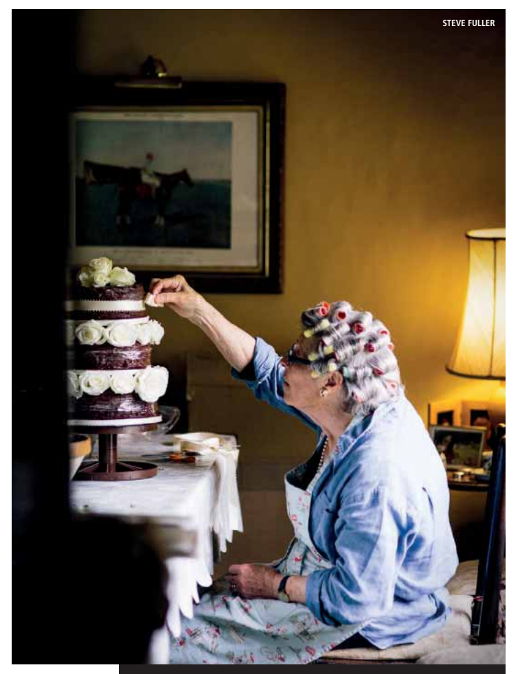
"A fortuitous combination of the room, the light, the moment, the rollers, me opening the door at the right time and a silent shutter makes this one of my favourite shots"