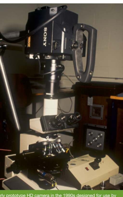
bolted onto my microscope as an nal Solutions Europe, Basingstoke pe as an experiment at So