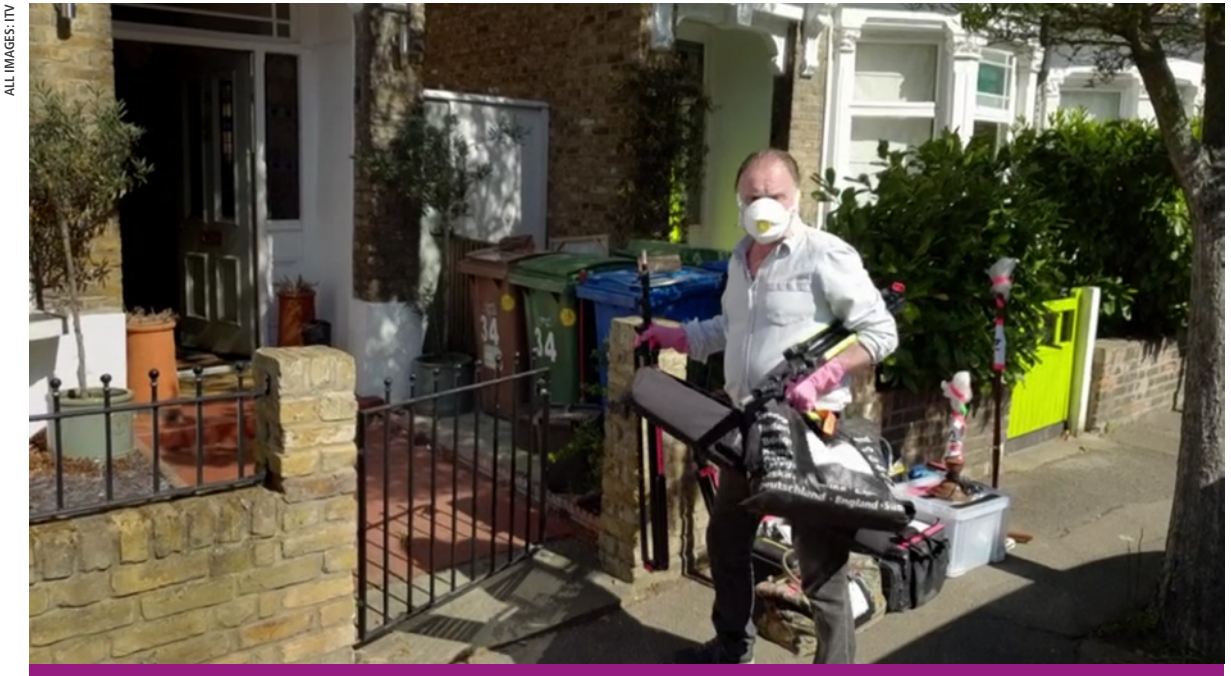
The masked crew-sader: actor Robert Glenister takes delivery of the props, camera, lighting and sound equipment for the shoot