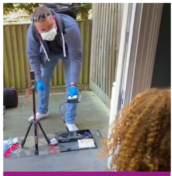
Tech instruction and support had to be done whilst adhering to strict quarantine and social distancing protocols

If I were given the chance to shoot another of these, with phones once again preordained, I would get my hands on the relevant model prior to the shoot and really familiarise myself with it. In an ideal world, I'd investigate many of the alternative wireless options available too, and – most importantly – test, test, test!