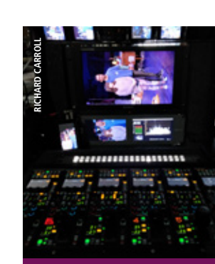
Vision control: The only landscape part of the rig

"If I were to tackle a shoot like this again, I'd like to have the vision position set so that the monitor is rotated correctly to reflect the ratio. Modern monitors