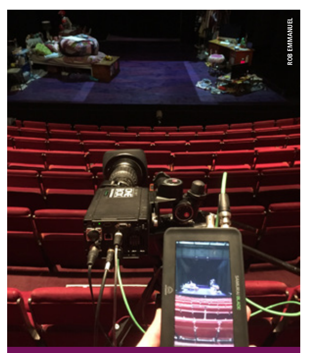
Locked-off P70 camera on a Manfrotto stills tripod – a wide of the stage in portrait really doesn't work and it was impossible to avoid shooting multiple seats foreground

A quick briefing highlighting the importance of mounting each camera on its 'L' bracket in exactly the same orientation, went like this: "Camera 5, you appear to be hanging upside down!", and then we were all set (albeit viewing the world in a new, mind-bogglingly tall and extremely narrow perspective). This was going to require some speedy rethinking of our deeply engrained understanding of camera grammar and nice framing.