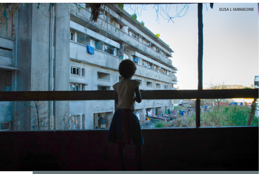
A child looks out of the Grande Hotel Beira, Mozambique, the current home of several thousand squatters in the city