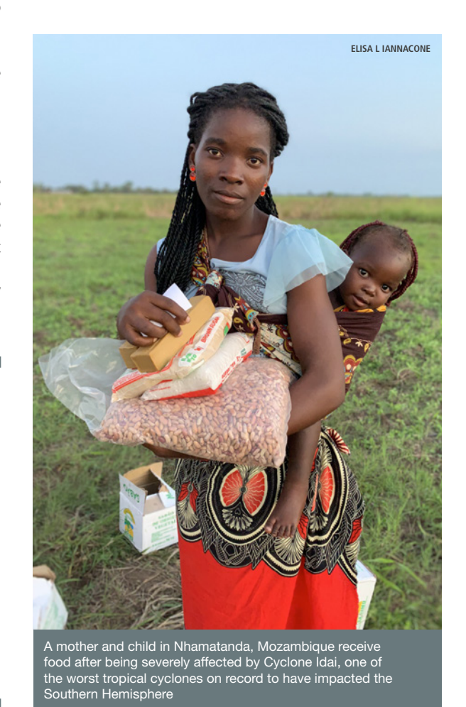
10 Autumn 2020 ZERB

able to successfully complete the assignment. Sometimes, the greatest hazards are not the bullets, but looking after one's health. While working in Mozambique last year, following the devastation of cyclone Idai, my number one priority was to keep healthy in order to be able to complete the shoot. In an already incredibly poor country, this natural disaster had destroyed 90% of the city of Beira and numerous rural communities were left without access to water or food. Many were forced to fish in highly contaminated water, with no access to electricity for refrigeration to preserve the fish