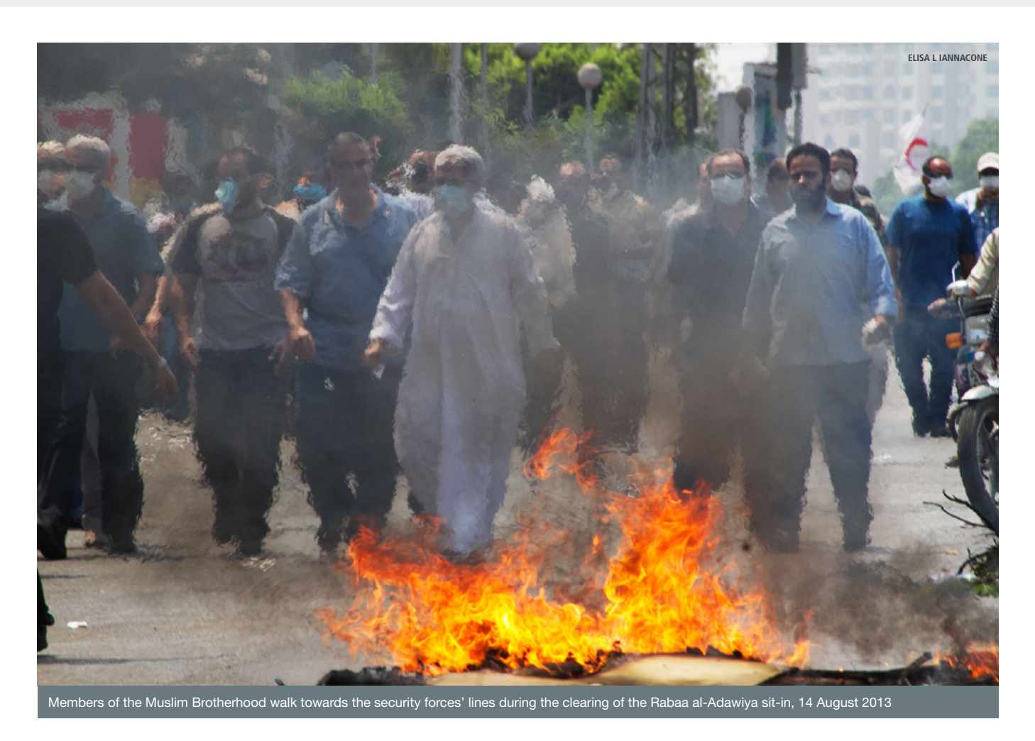
Amidst all the kinetic energy rippling through Cairo at the time, a camp known as Rabaa was created. Thousands took over the streets of a predominantly residential area of apartment buildings and mosques. A stage that would become the focus of the daily protests and chants was erected, and designated male and female prayer areas were created. As this was all taking place during Ramadan, there were cooks on site to prepare food for Iftar, the meal to break the daily fast, after sunset Maghrib prayers. A central mosque was used as a space where women could escape from the heat of the day, allowing them privacy to take down their hijabs and burgas for a while.