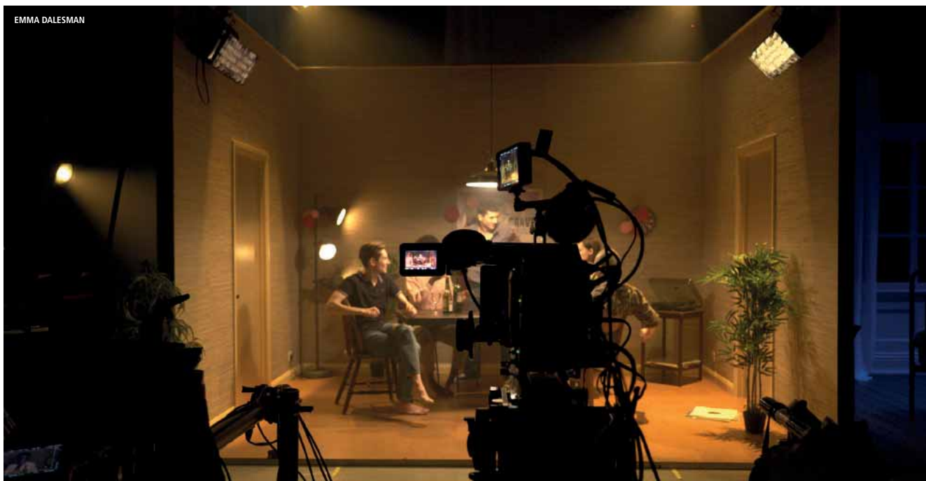
Cast and crew are set and ready, minutes before going live for the first time on Rooms

hire houses, when production stopped due to the pandemic, a lot of the PeeWees were returned to Chapman who own them. Combined with the effects of Brexit, this then led to there being a shortage in the country – but, luckily, once again, VMI managed to get hold of a couple for us.