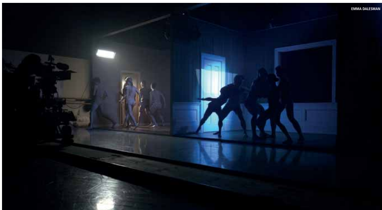
Working out transitions during rehearsals for Rooms

light in each room. The colours on the PL8 are fantastic (as is the white) and I could seamlessly add them into each scene, regardless of whether the other lights were LED or tungsten. They looked great on the dancers and it was fantastic to be able to use a bit of softer light where it really mattered, which isn't very common in stage lighting.